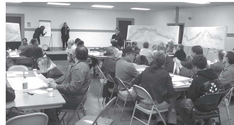
Participants at the April 26, 2006 Community Meeting reviewed draft plans and made recommendations for modifications.

* Stations will be set up illustrating the plan elements, with Project Team Members available to talk with attendees. A brief presentation at 7:15 p.m. will be followed by discussion groups and a Question and Answer period. (Map of meeting location on back page)